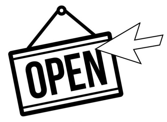
13% (Average % of Unique Clicks to Open***)

POWERHOUSE is distributed on a weekly basis. By utilizing RASA, an AI informed news aggregator, NHA is able to find and identify stories about waterpower related to member interests. Relevant stories are then 'fed' back to readers via a personalized email.