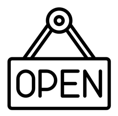
2,300 (35% of Recipients) (Average # of Unique Opens**)