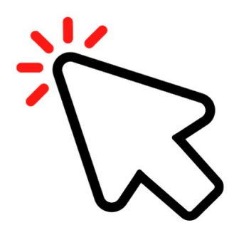
282 (5% of Recipients) (Average # of Unique Clicks*)