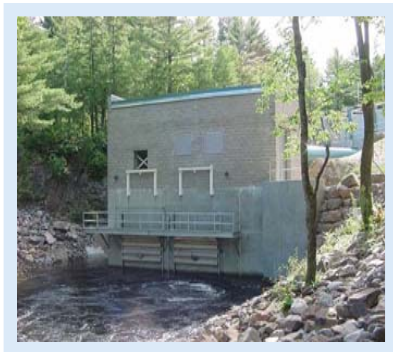
Oswegatchie hydroelectric plant