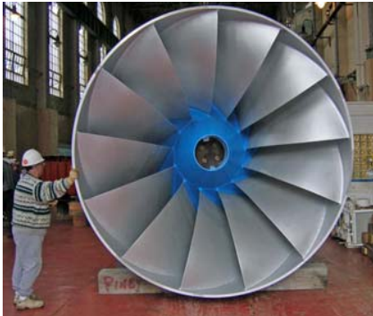
New waterwheel at Piney