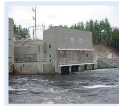
Higley hydropower development