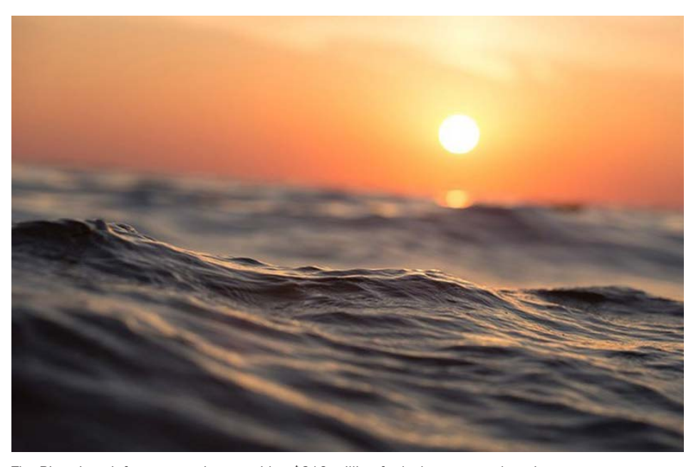
The Bipartisan Infrastructure Law provides $910 million for hydropower and marine energy programs under the U.S. Department of Energy to broaden access to clean energy.

A total of $910 million is directed to DOE for the following water power-specific provisions.