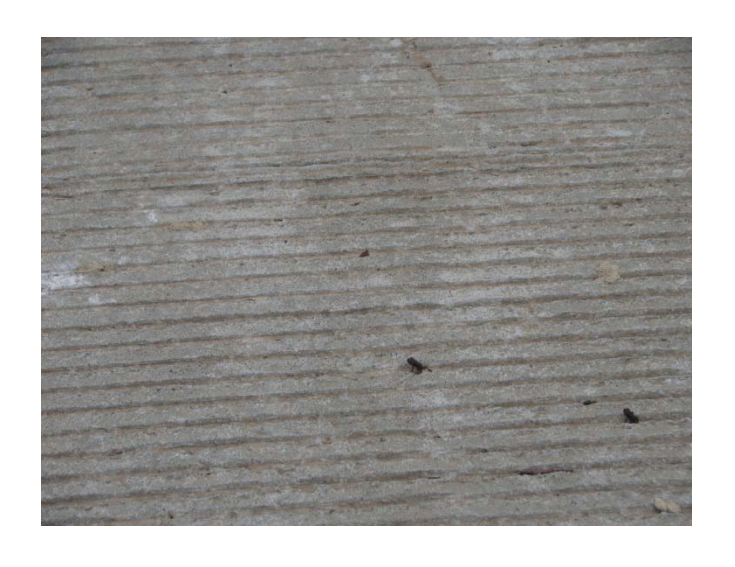
Toads crossing ramp