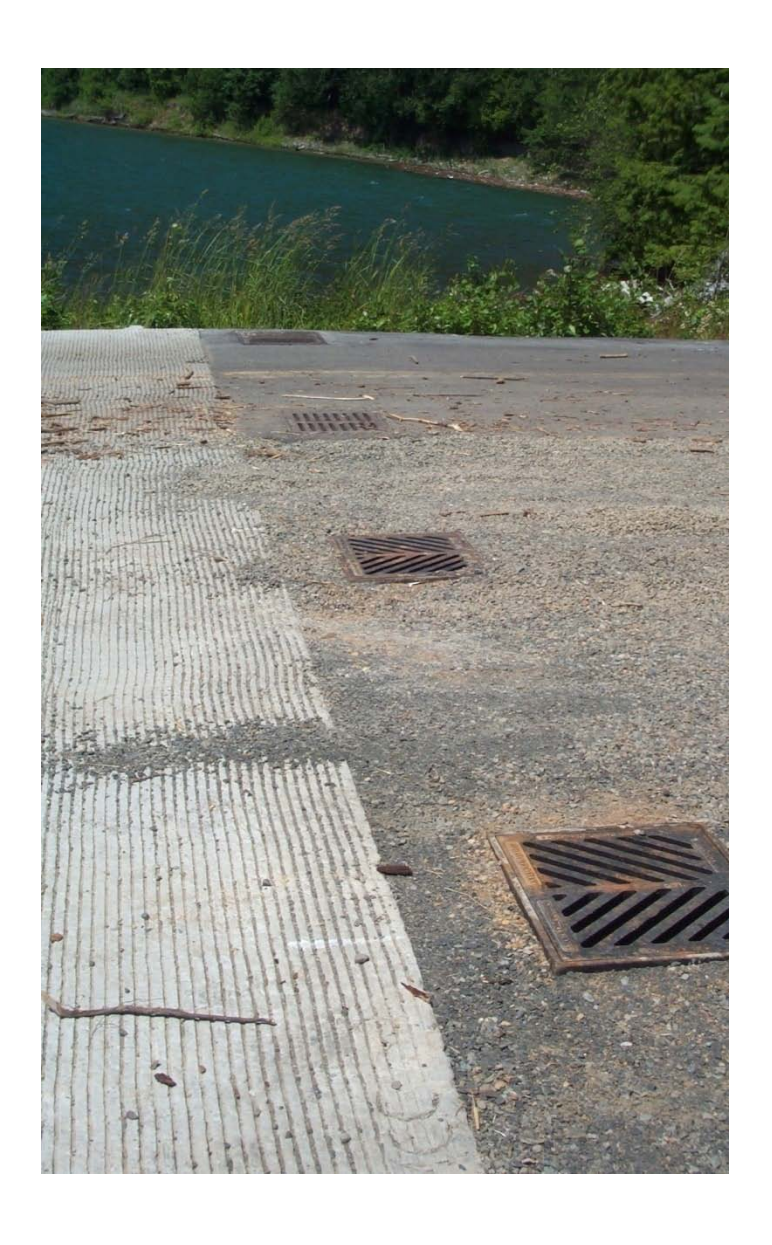
Vents in toad tunnel