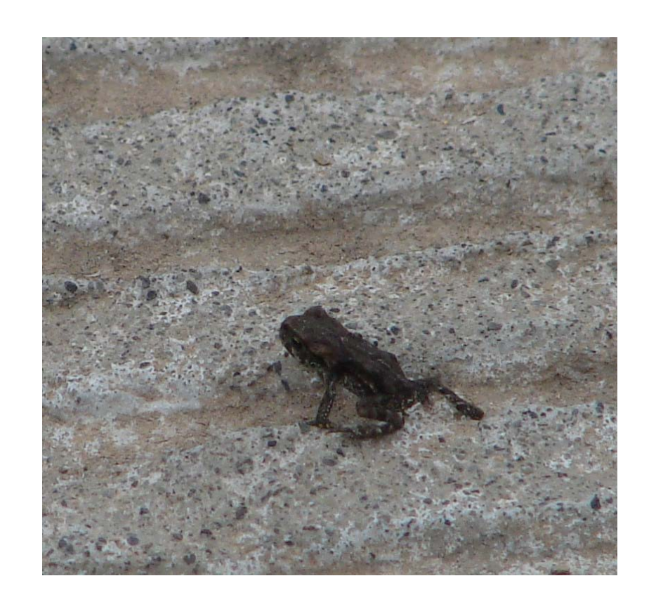
Toad on ramp