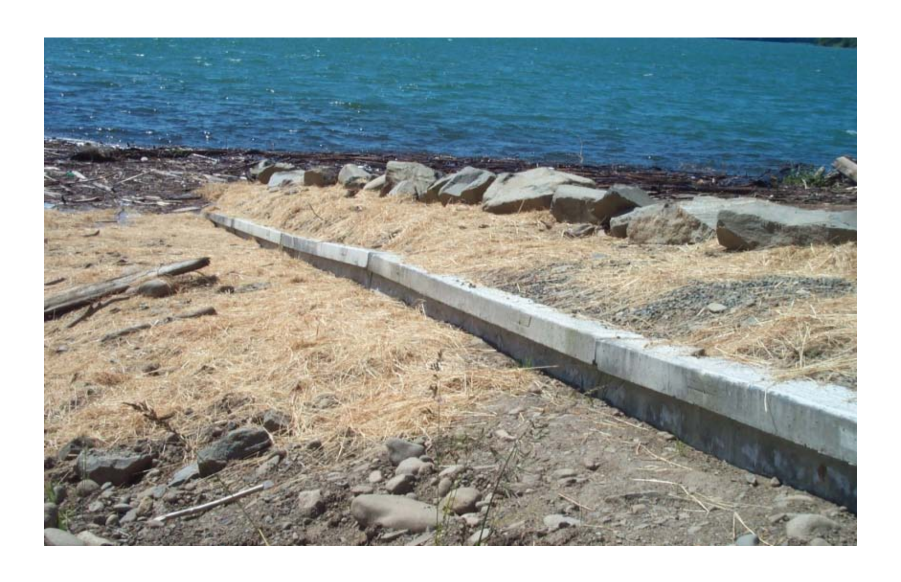
Leads to toad tunnel